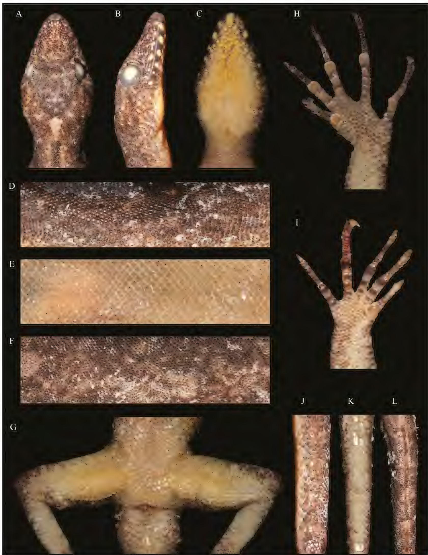
Fig. 2. Close-ups of Cnemaspis anslemi sp. nov. male holotype (NMSL.2019.14.01): (A) dorsal, (B) lateral, (C) ventral aspects of head, (D) scales on lateral surface of trunk, (E) smooth ventral scales, (F) homogeneous dorsal scales, (G) cloacal characters with femoral pores, (H) subdigital lamellae on pes, (I) subdigital lamellae on manus, (J) lateral side of tail, (K) oval shaped subcaudals, and (L) dorsal scalation of tail.